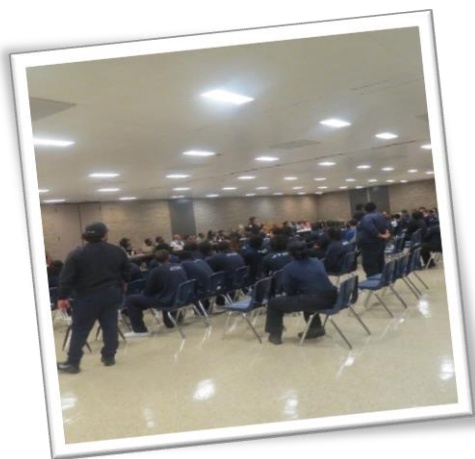
Staff and residents actively participating in a panel discussion with filmmakers and music artists.